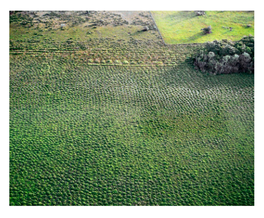
Fig. 1. Pre-Columbian raised fields in Savane Corossony, showing the small, round mounds (most of those figured here are about 1–1.5 m diameter) that characterize many sites. Fig. S1 illustrates the diversity of French Guianan pre-Columbian raised fields and shows the distribution of raised fields along the Guianan coast.

fields to provide crops with well-drained soils in seasonally flooded savannas (5, 26, 27).