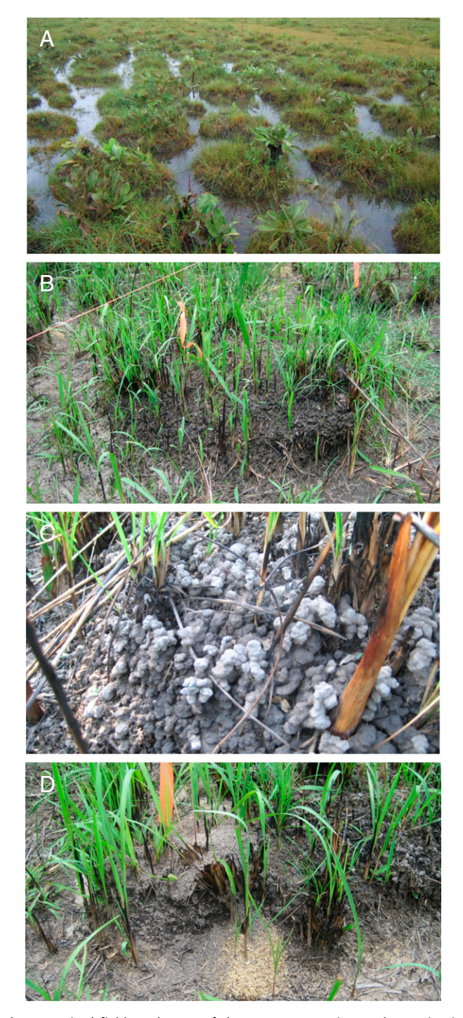
Fig. 4. Raised fields and some of the ecosystem engineers that maintain them. ( A ) Part of the vast complex of abandoned raised fields in Savane Grand Macoua in the rainy season (April 2007). Only the abandoned raised fields are above water level. ( B ) Abandoned raised field in the dry season, totally covered with earthworm casts, absent from the surrounding matrix. Note higher plant density on the abandoned raised field. ( C ) Surface of a typical abandoned raised field, completely constituted of earthworm-produced biogenic structures. ( D ) Material associated with an Acromyrmex octospinosus nest on an abandoned raised field. Light brown material covering the top of the mound is excavated soil, yellow-brown material at center bottom is plant debris deposited from the ants' fungal farm.

scapes since long before raised fields were abandoned. These central-place foragers move materials to raised fields. Acromymex workers carry large quantities of plants to the nest to feed their